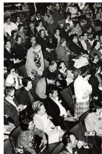
1972. Frater Congress in Rome.